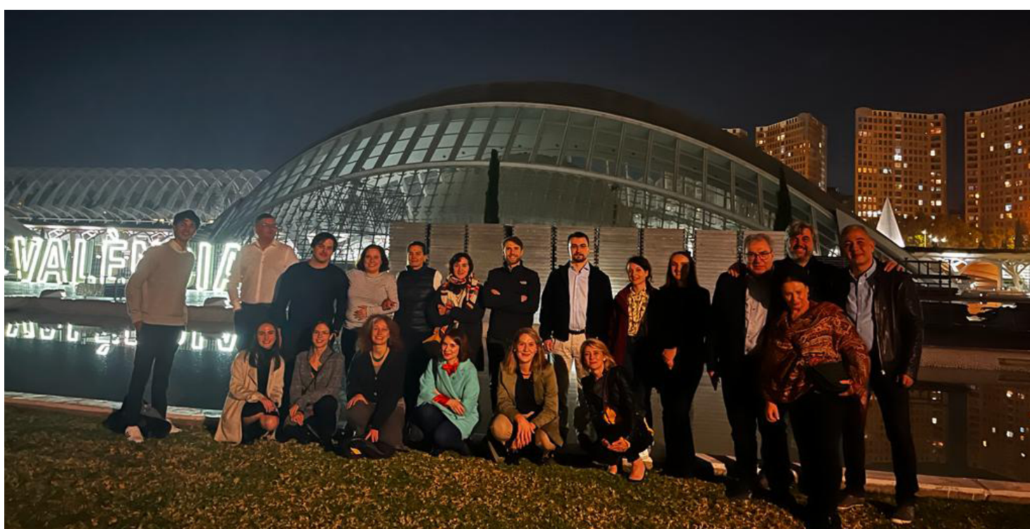
⤴ Consortium meeting Valencia (ES)

We will soon meet again in April 2024 in Rome , hosted by UniverCities!